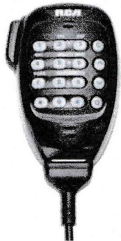
Optional MM301HDK Keypad Microphone